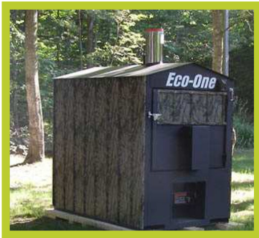
The Real Tree camouflage sheltered Eco-One 275 ready for another heating season.